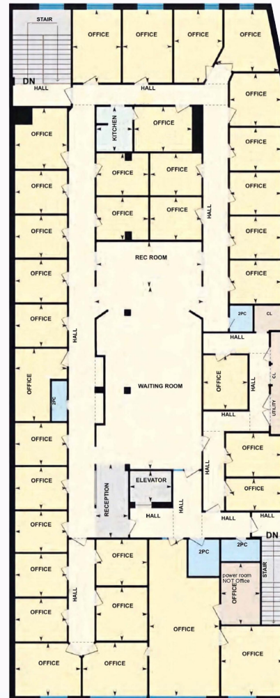
*EXISTING FLOOR PLAN

Kingston General Hospital 2.5 km | 7 mins