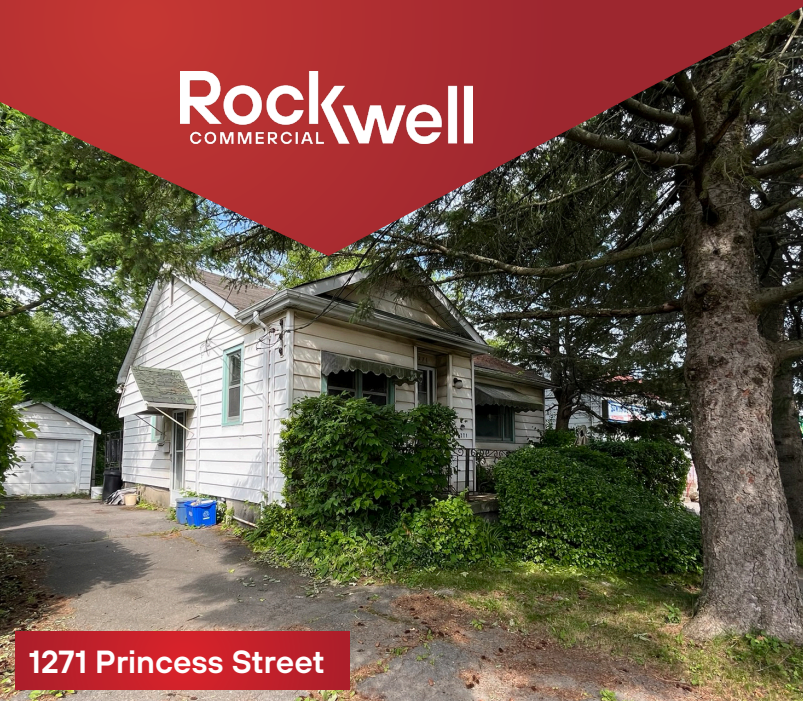
1271 Princess Street