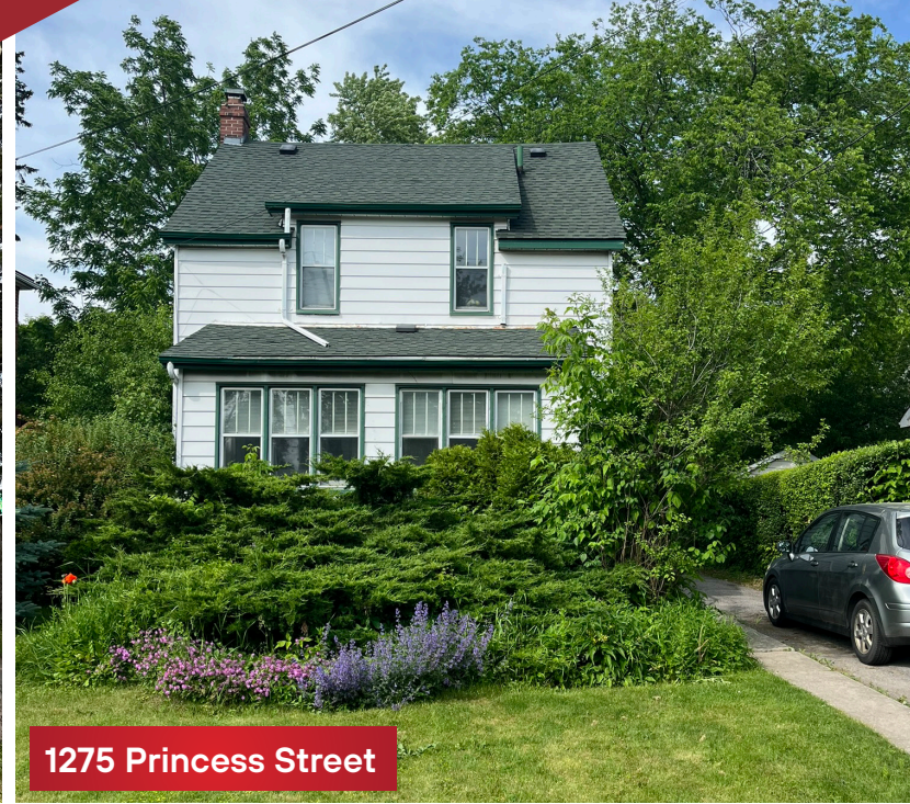
1275 Princess Street