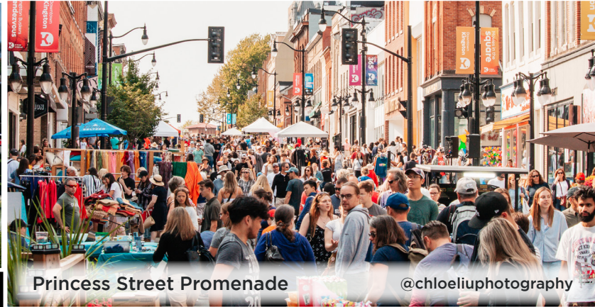
Princess Street Promenade