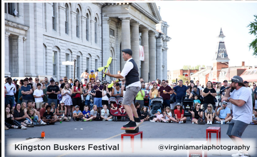
Kingston Buskers Festival