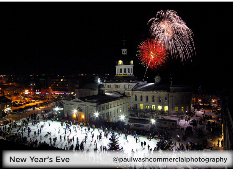
New Year's Eve