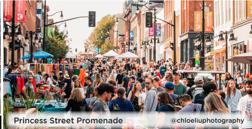
Princess Street Promenade