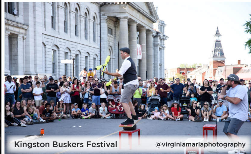
Kingston Buskers Festival