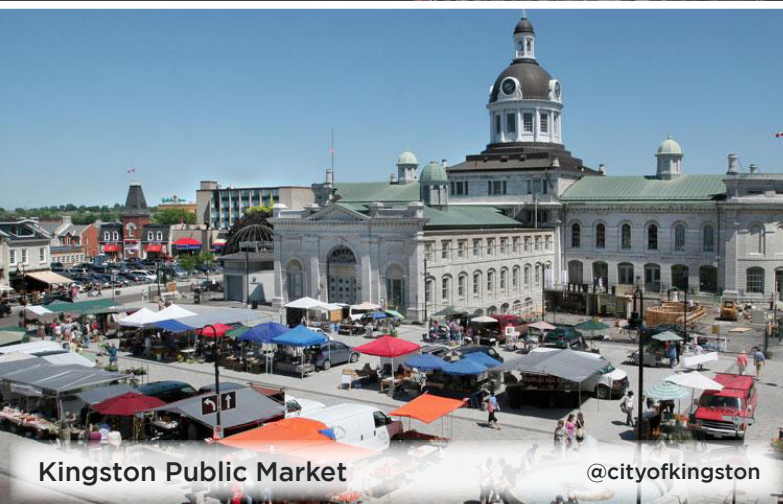
Kingston Public Market